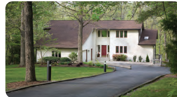
An alternative sealcoat: If sealcoating cannot be avoided, asphalt-based sealcoats are an alternative with 1/1000th the PAH concentration of coal tar-based sealcoats.

Studies show 50-75% of all PAHs found in sediments within the Great Lakes region come from coal tar sealcoat.